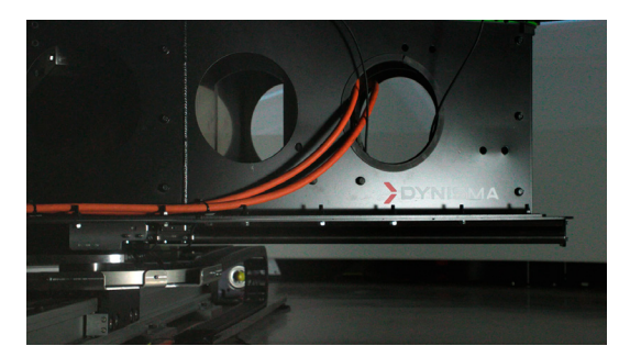
The LFP comprises three belt driven actuators (ground rails)