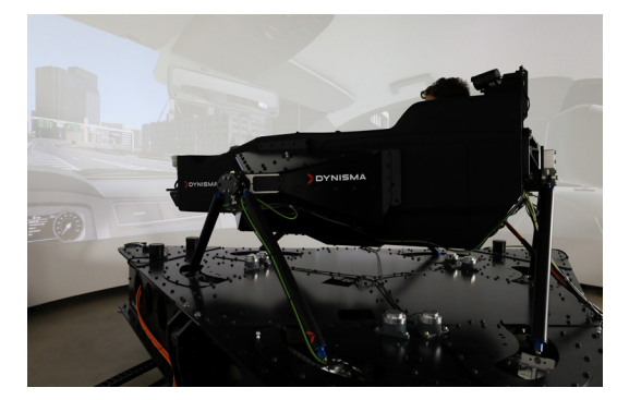
DMG-1 motion generator

"The main requirement for DMG-1 was that we needed an encoder that gave absolute feedback and incremental feedback in the same readhead. We essentially wanted direct feedback to the safety system for both the position and velocity of the relevant axis; if we had to do that with an encoder that only gave us an absolute signal then we would need to fit a different encoder for an incremental signal which takes up more packaging space. The LA11 was ideal because it minimised our space requirements by producing both absolute and incremental signals from one readhead and scale tape," Joshua Bell concludes.