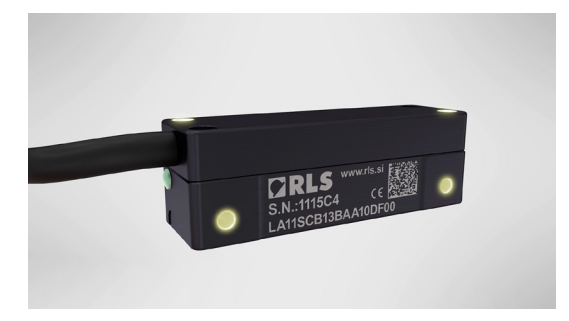
RLS' LA11 absolute magnetic linear encoder