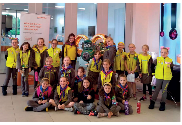
Event for local Girlguiding groups to celebrate International Women in Engineering Day at New Mills

We confirm the data reported is accurate.