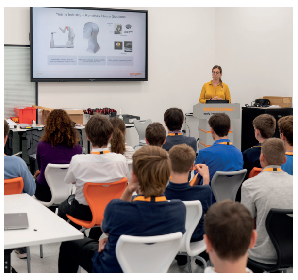
A presentation at our engineering work experience week, July 2022

Renishaw became a Disability Confident Employer in 2021, and with our dedicated EDI resource we'll continue to work on this programme. This is a UK Government scheme that supports us to make the most of the skills of disabled people within our organisation and helps us to recruit from the widest possible pool of talent. This year we aim to achieve Disability Confident Level 2 certification.