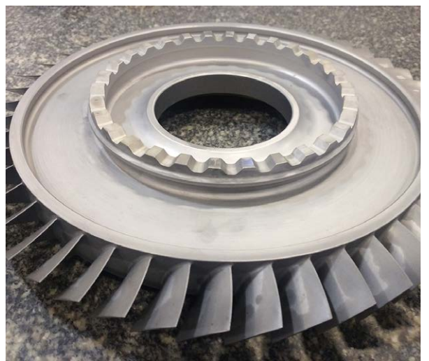
After: the finished blisk

During the machining process, the Renishaw probe touches the part in various places to identify whether there are any errors or misalignments.