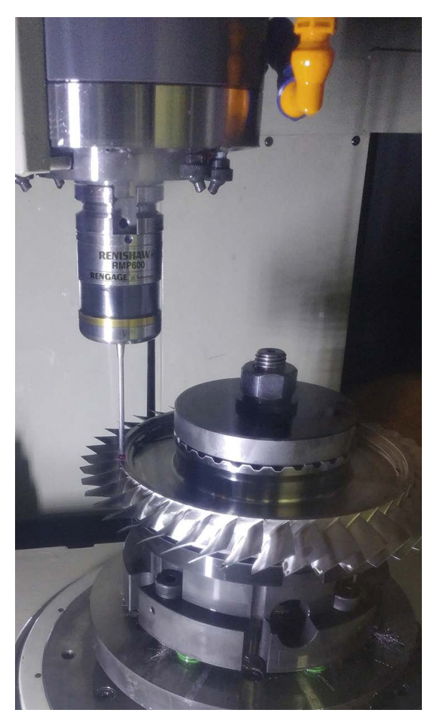
Reinshaw's RMP600 high-precision touch probe

"The probe helps us detect any inaccuracies before a defect occurs", continued Gallegos. "Previously, we had no way of identifying a problem until 16 hours of machining and over an hour of measuring had passed. We can now receive some warning that a part is incorrect and perform the necessary corrective actions before precious machining time and resources are wasted."