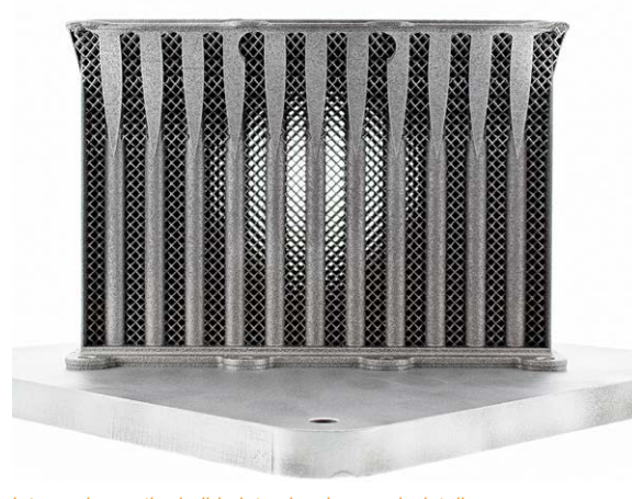
Intercooler on the build plate showing mesh detail

Metal powder bed fusion uses a powerful high precision laser to fuse fine metallic powders in order to form highly complex functional components. The design of the parts is optimised using 3D computer-aided design (CAD) and the components themselves can be built from a wide range of metal powders melted in a tightly controlled inert atmosphere, in layers with a thickness ranging from 20 \mu m to 100 \mu m.