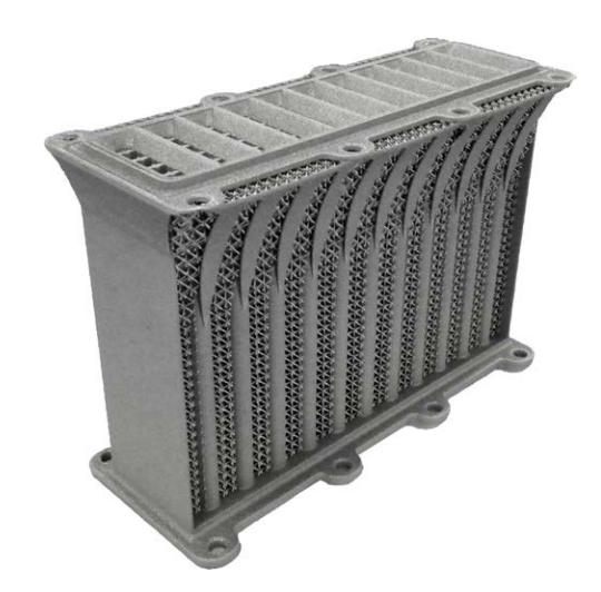
Intercooler built as one piece in Aluminium alloy using Renishaw AM technology

This is where the intercooler comes in; placed between the outlet from the turbocharger's compressor and the engine intake plenum, it removes heat from the air flowing into the engine and transfers it to the surrounding atmosphere. This further increases the density of air flowing into the engine, developing more power.