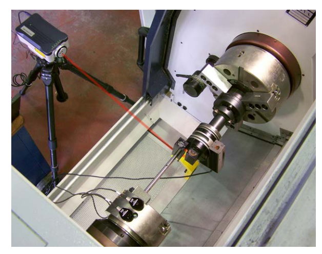
Calibration of a turning centre sub-spindle using the Renishaw RX10 rotary calibrator

Currently, one-in-five of Spinner's CNC turning centres have their linear axes fully calibrated, in response to a customer's request for higher accuracy machines. On those machines that are not calibrated, the machine positioning is checked at only two positions, 0 and 300 mm, adding a single compensation value to the machine's register and not taking into account anything in between. Spinner turning centres can be supplied with three main axes, X, Y and Z, and also the moving axis for the sub-spindle.