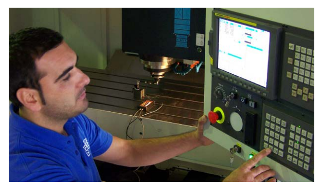
Spinner use the ballbar to set up the control systems at the factory, then to help mechanically adjust out geometry errors caused by installation at a customer's site

The RX10 is an accessory for Renishaw's laser calibration systems, allowing the comparison of the programmed rotation of a drive or rotary table to the actual rotation as measured using a traceable laser source. This is done by mounting the RX10 on the rotary axis, then programming the rotary axis to rotate in defined steps. After each axis move, the RX10 unlocks, and rotates back to the previous position, re-locking on a highly repeatable Hirth coupling, accurate to 1 arc second. Angular optics are mounted on the RX10 and any angular error compared to the previous starting position is recorded. These error values are used for compensation.