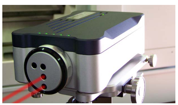
The Renishaw XL-80 laser

The RX10 is an accessory for Renishaw's laser calibration systems, allowing the comparison of the programmed rotation of a drive or rotary table to the actual rotation as measured using a traceable laser source. This is done by mounting the RX10 on the rotary axis, then programming the rotary axis to rotate in defined steps. After each axis move, the RX10 unlocks, and rotates back to the previous position, re-locking on a highly repeatable Hirth coupling, accurate to 1 arc second. Angular optics are mounted on the RX10 and any angular error compared to the previous starting position is recorded. These error values are used for compensation.