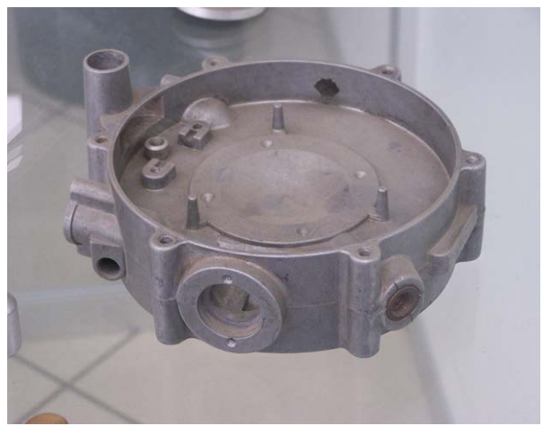
Typical pump component produced by Spinner customer Bosch

The Istanbul plant produces Spinner's range of TC turning centre machines, while the SP, PD and UP (ultra precision) ranges are made in Germany. 80% of the Turkish TC machines are sold in Germany, with 20% sold to other countries, in particular Turkey, Pakistan, India and Malaysia. There are now over 100 machines in Turkey, at companies such as Ford, Bosch Rexroth, and CMS, a large supplier of automotive wheels.