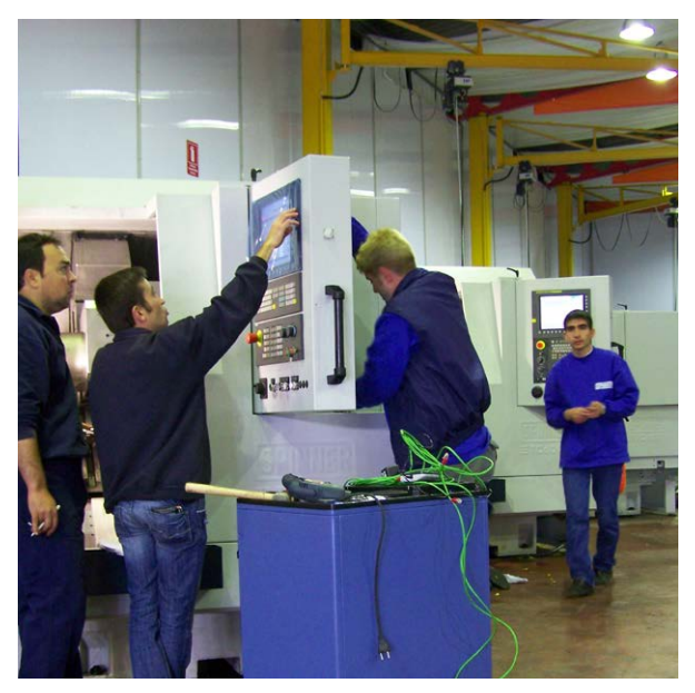
The Spinner factory in Istanbul is a hive of activity, producing over 30 machines a month