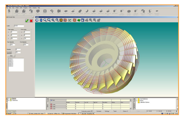
MODUS<sup>™</sup> screenshot - circular slice

He continued, "With our new team of engineers and our recent investments in software engineering in the UK and India, we now have a top-flight metrology package and the means to develop it. Our strategy is to enhance MODUS<sup>™</sup> to keep pace with our forthcoming solutions, including new sensors for the REVO<sup>™</sup> platform. This will ensure that MODUS<sup>™</sup> users are always amongst the first to benefit from innovations in measurement technology."